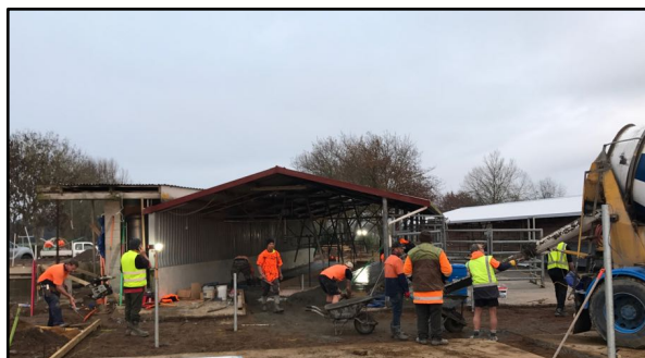
Conversion of a bovine dairy farm to a sheep milking operation