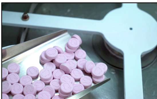
Product development underway