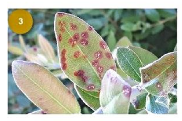
As the infection progresses, bright yellow powdery eruptions of spores appear on both sides of the leaf