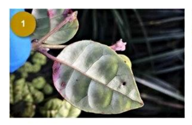
Small bright yellow powdery eruptions first appear on the underside of the leaf