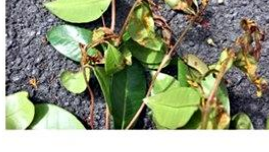
Overtime, the damaged leaf darkens and becomes brown and rust pustules turn grey