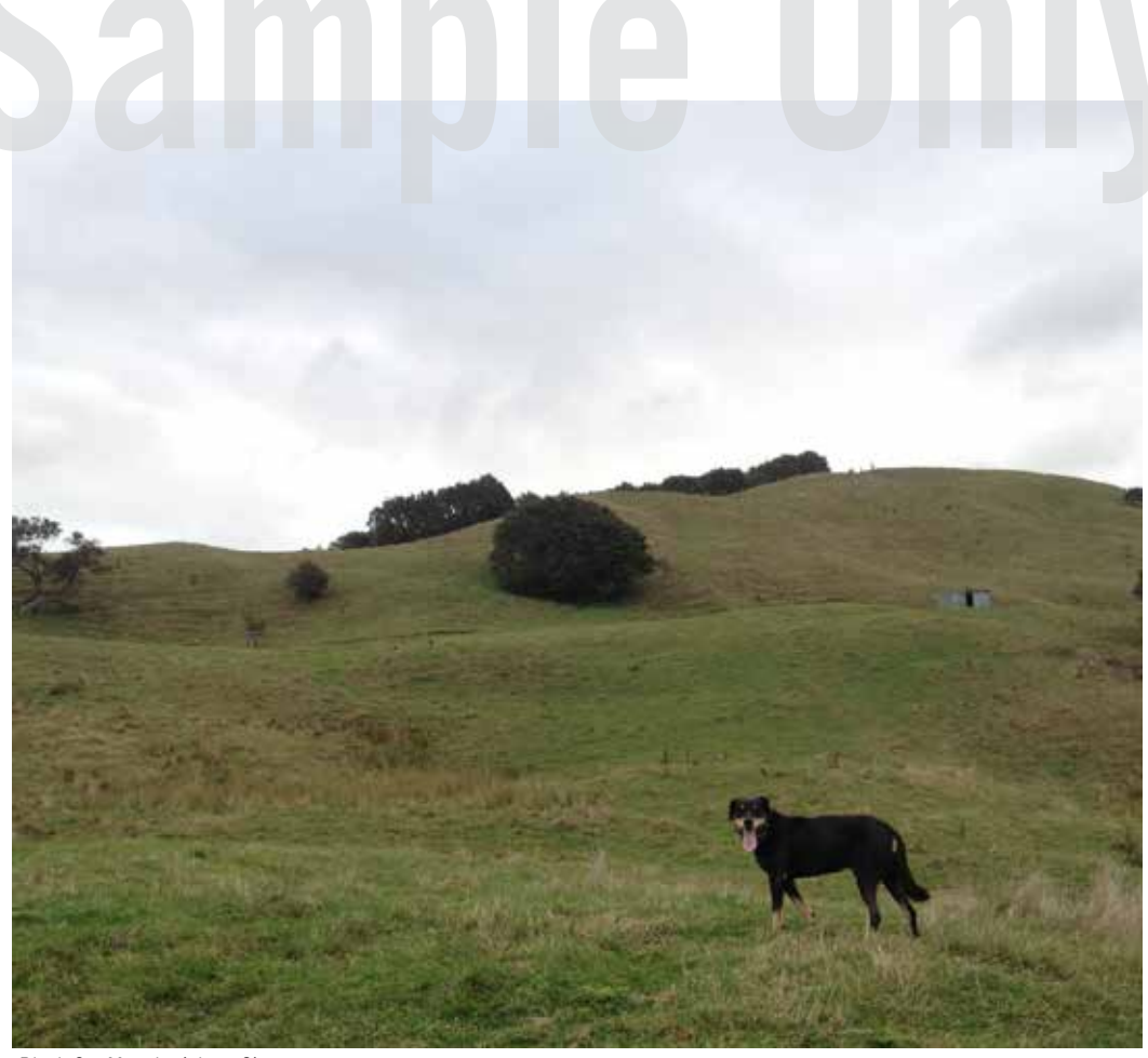
Block 2 – Manuka (photo 3)